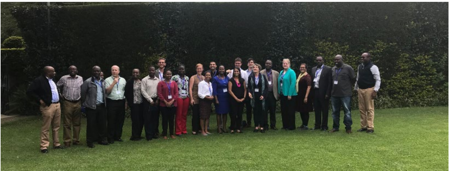
Attendees of the 2019 Strategic Planning meeting in Eldoret, Kenya.

The following report provides a snapshot of AMPATH’s research activities from July 1 – December 31, 2019. It includes progress updates from 52 research projects active during this period. Each update includes a summary abstract of the project’s aims, an update on progress made during the reporting period, and the project’s objectives for the next 6 months. Each report was provided by the project’s Principal Investigator or their designee and, with the exception of formatting, are presented here largely unedited.